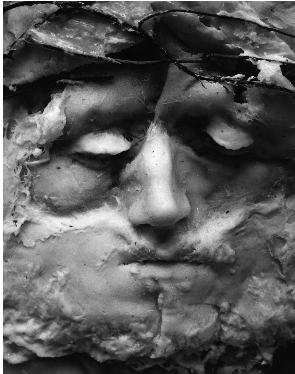
Dot Gain 10%