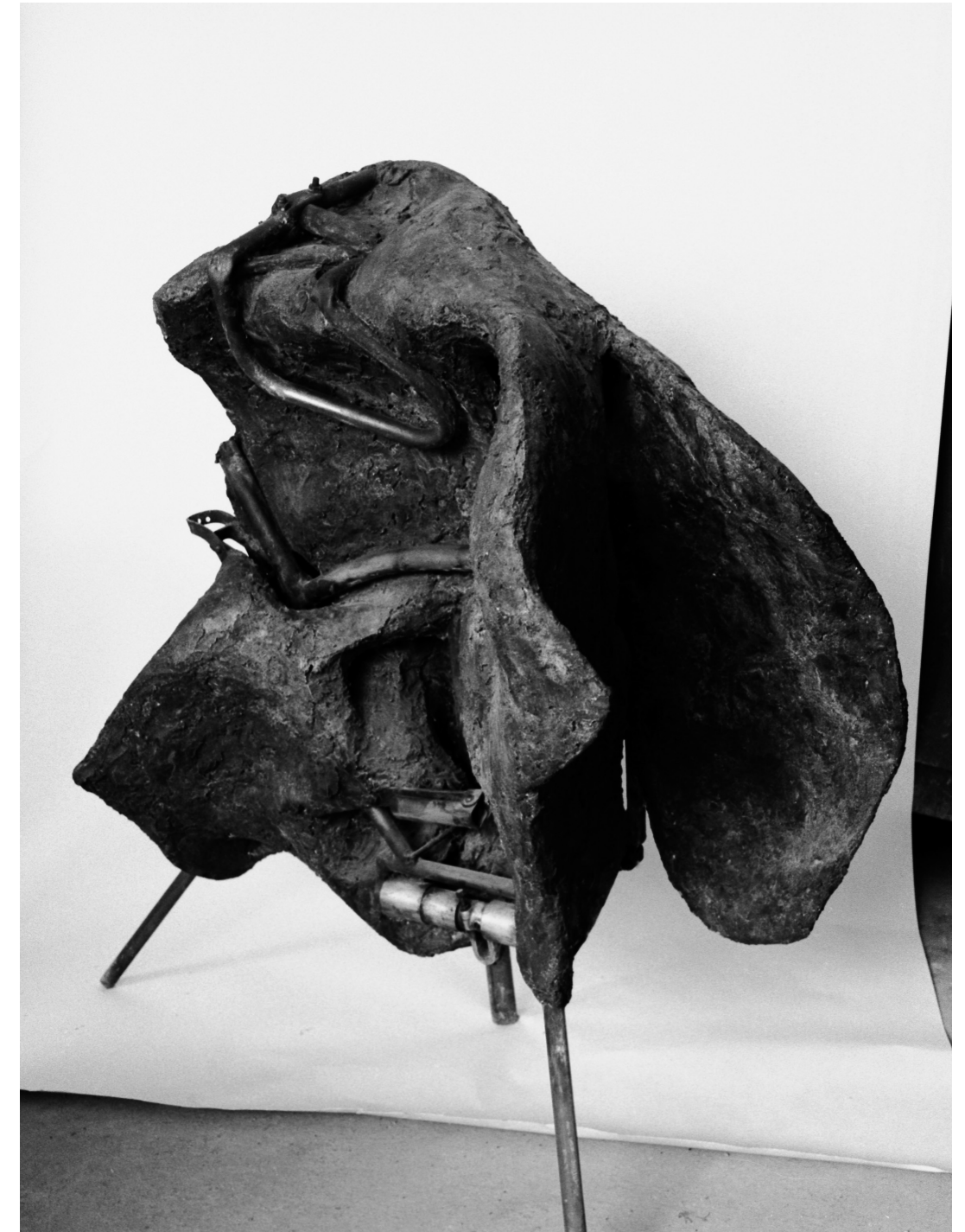
Dot Gain 10%