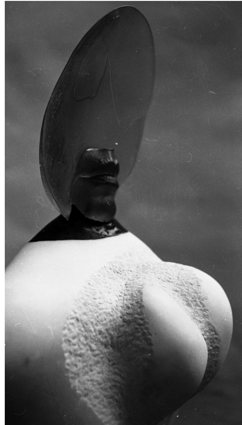
Dot Gain 10%