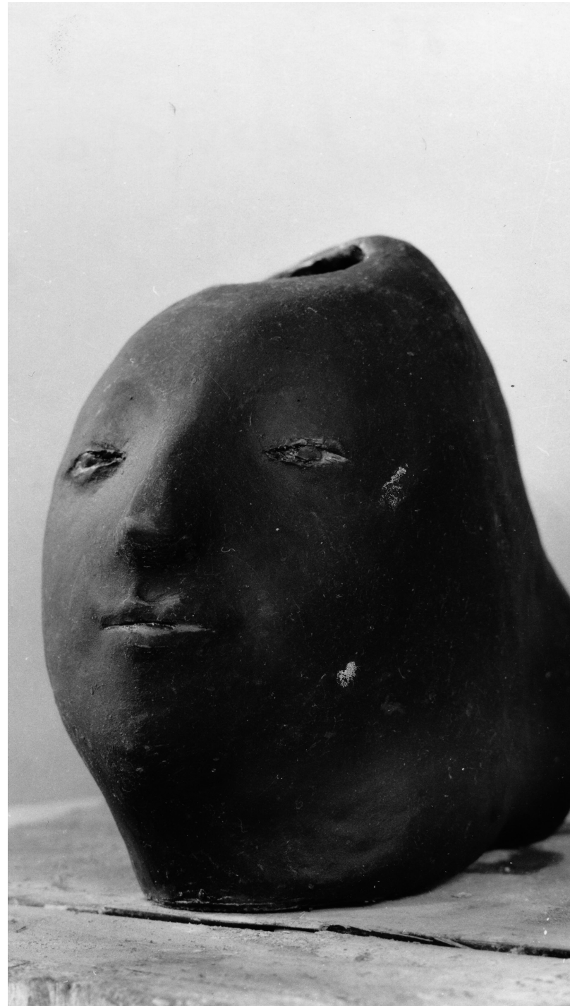
Dot Gain 10%